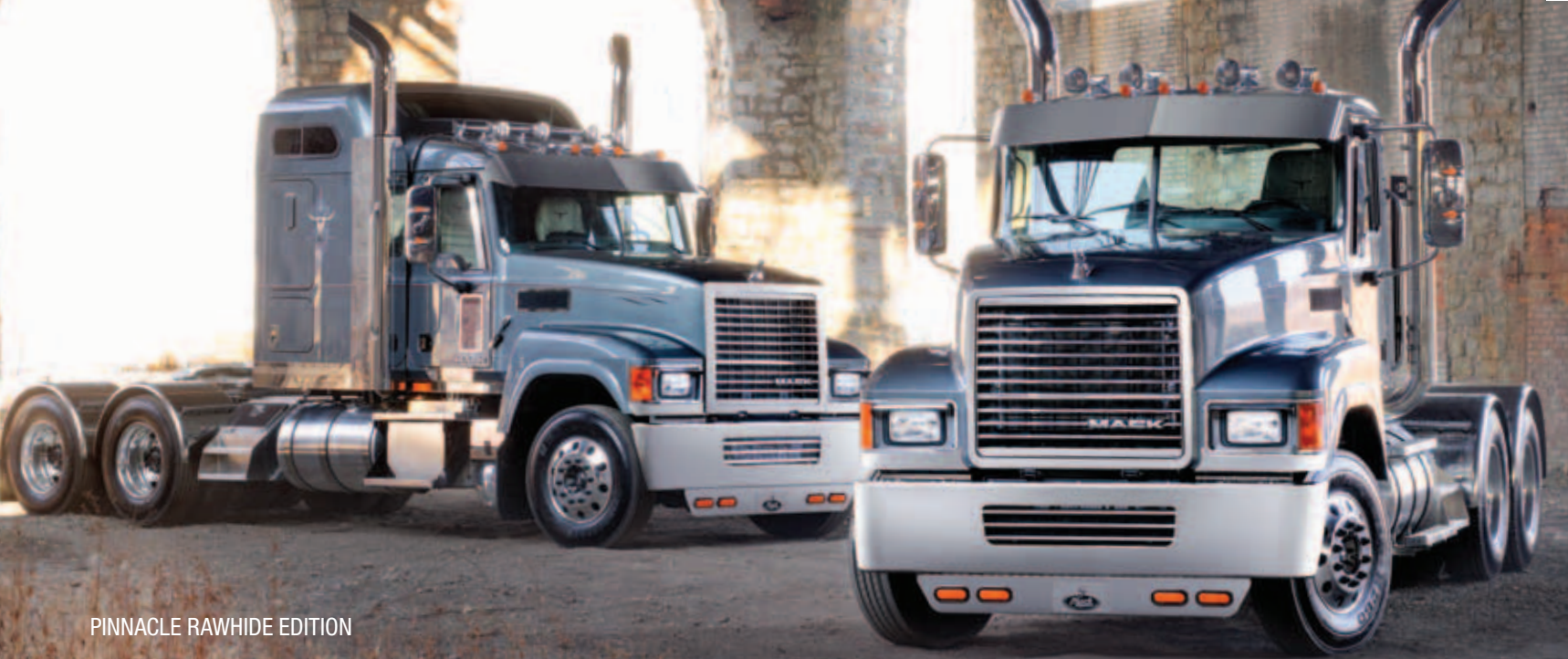
PINNACLE RAWHIDE EDITION