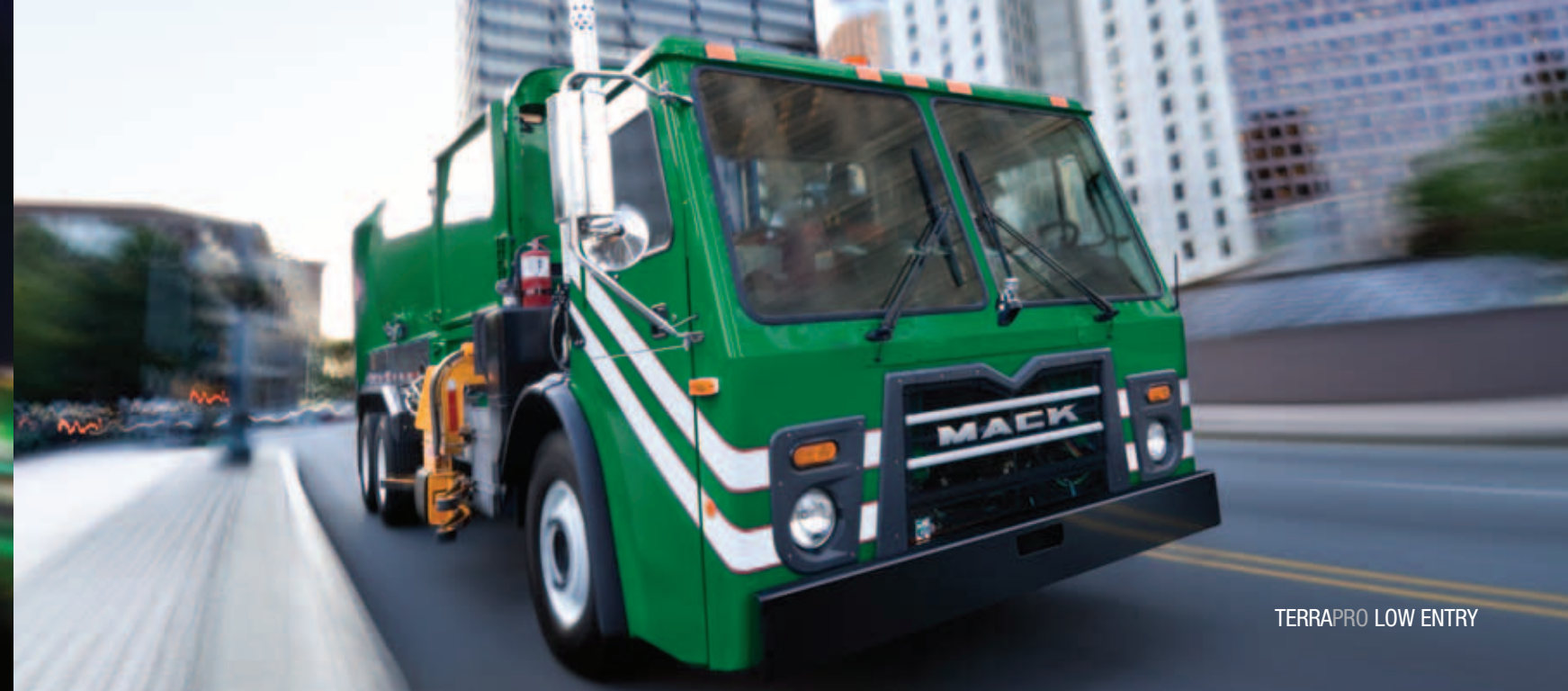
TERRAPRO LOW ENTRY