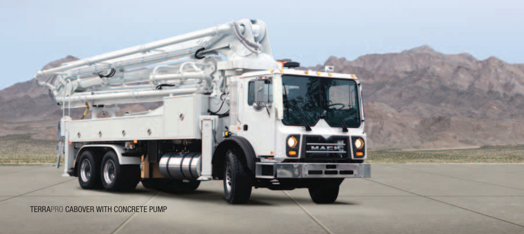
TERRAPRO CABOVER WITH CONCRETE PUMP