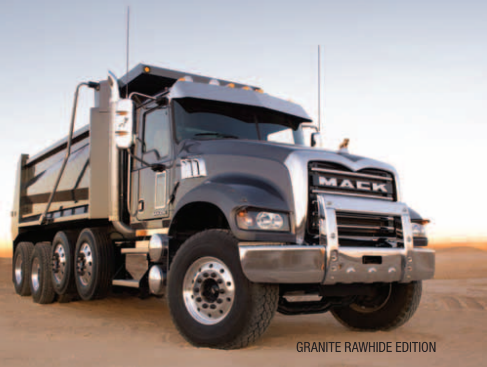
GRANITE RAWHIDE EDITION

Available on Pinnacle Axle Forward, Titan by Mack and Granite® models, the all-new Rawhide Edition celebrates the finer things in life. These well-appointed trucks feature a brushed nickel dash, a leather-grip steering wheel and two-tone Ultraleather™ seats with Rawhide Logo and bold stitching. The exterior boasts a host of upgrades, including bright-finish stacks with chrome Bullhorns, quad trumpet air horns with snow shields and a stainless steel, extended sun visor.