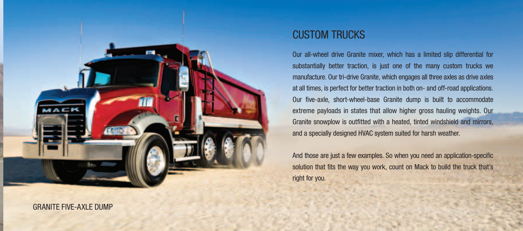
GRANITE FIVE-AXLE DUMP